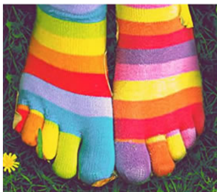
MEIA FEMIN.C/DEDO JED MIA-301 VALOR R$ 3.90