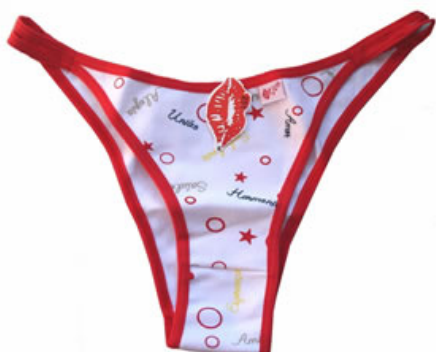
TANGA BEJU COTOM VALOR R$ 3.80