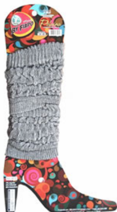
POLAINA ADULTO BF61 BY FIAPO VALOR R$ 5.00