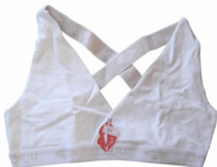
TOP COTOM BEJU VALOR R$ 7.80