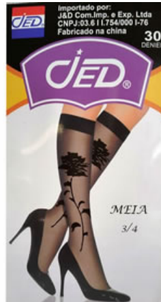
MEIA 3/4 MIA-509 JED VALOR R$ 4.40