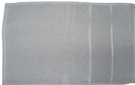
TOALHA LAVABO MARCOTEX VALOR R$ 2.20