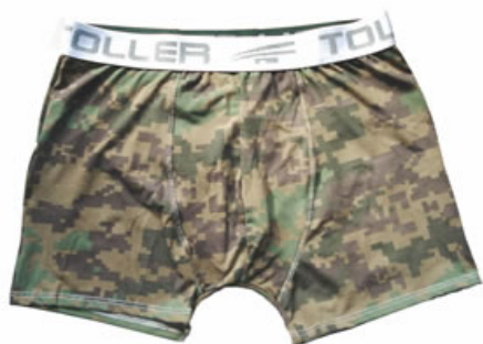
CUECA BOXER ADT 1000 TOLLER VALOR R$ 11.50