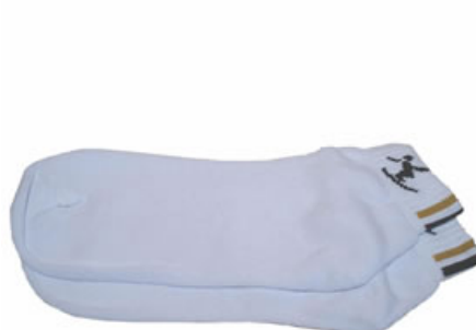
MEIA BY FIAPO CANO BAIXO BFEBX VALOR R$ 3.95