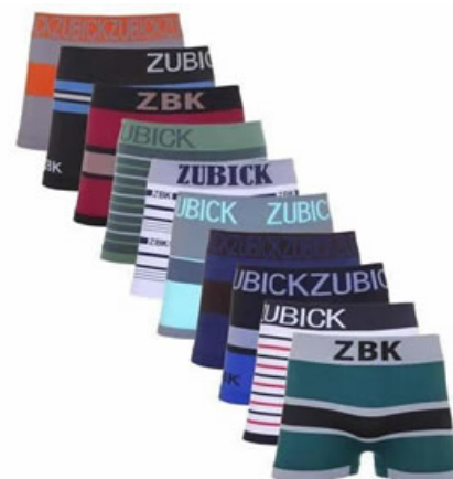
CUECA BOXER ALLABARD VALOR R$ 7.90