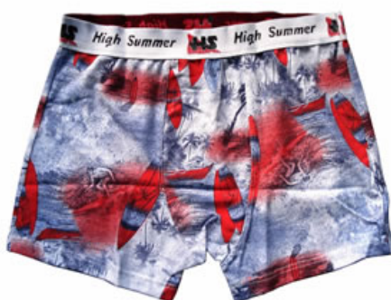
CUECA BOXER JUVEENIL 105 HS VALOR R$ 7.90