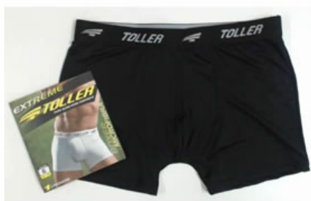
CUECA BOXER ADT 109 TOLLER VALOR R$ 10.95