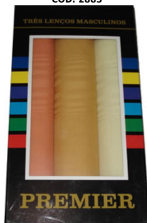
LENCO MASC. PREMIER C/3 VALOR R$ 16.00