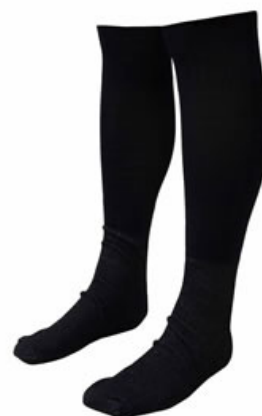
MEIA FUTEBOL 149 NEVADA VALOR R$ 3.95