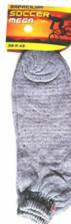
MEIA SAPATILHA SOCCER VALOR R$ 1.75