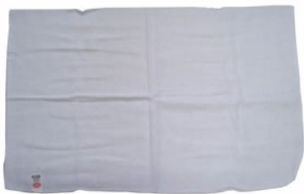
PANO DE SACO 55X65 BR FAAP VALOR R$ 4.70