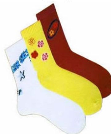
MEIA BY FIAPO FEMININA BF 67 VALOR R$ 4.20