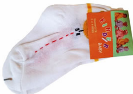
MEIA KINDER BABY VALOR R$ 1.00