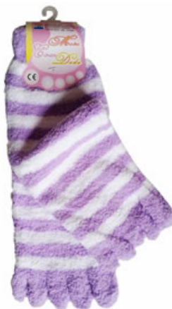
MEIA FEMIN.C/DEDO JED MIA-303 VALOR R$ 3.90