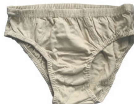
CUECA INFANTIL HS 002 VALOR R$ 2.65