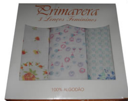
LENCO PRIMAVERA C/3 FEMININO VALOR R$ 6.30