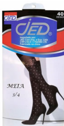
MEIA 3/4 MIA-508 JED VALOR R$ 6.90