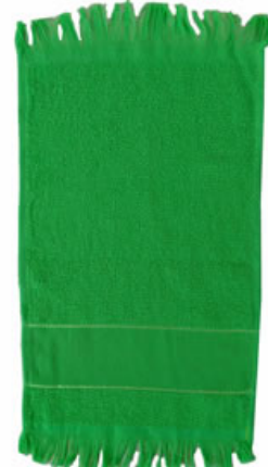
TOALHA SOCIAL MARCOTEX VALOR R$ 1.15