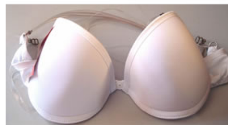
SOUTIEM BY BELLA COSTANUA VALOR R$ 12.30