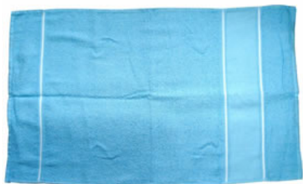
TOALHA ROSTO MARCOTEX VALOR R$ 5.15