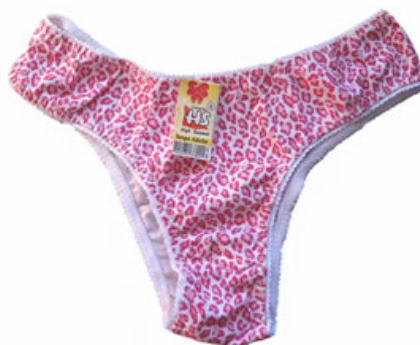
TANGA HS ADULTO VALOR R$ 2.75