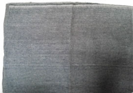
PANO DE SACO 55X65 CINZA FAAP VALOR R$ 3.95