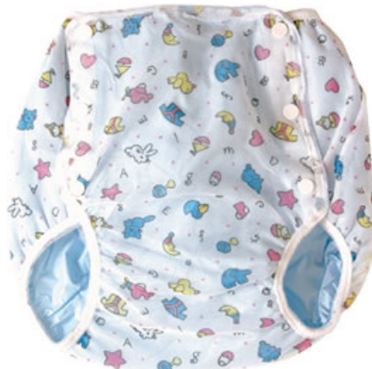
CALÇA PLASTICA MERVER VALOR R$ 2.00