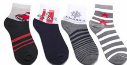
MEIA BY FIAPO KIDS MASC. BF58 VALOR R$ 4.30