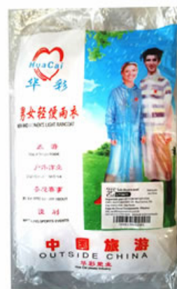
CAPA DE CHUVA VALOR R$ 1.35