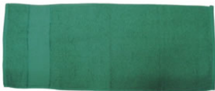
TOALHA FITNESS MARCOTEX VALOR R$ 2.90