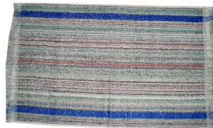
TOALHA ROSTO LISTRADA FAAP VALOR R$ 2.70