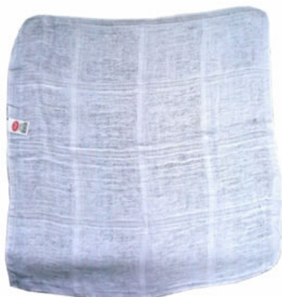
FRALDINHA 50X45CM FAAP VALOR R$ 2.60