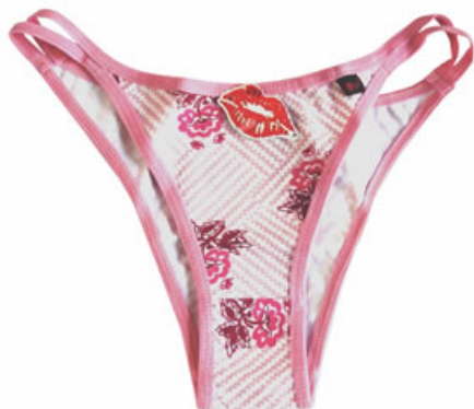
CALCINHA BEJU 251 VALOR R$ 4.80