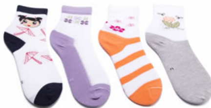
MEIA BY FIAPO KIDS FEM. BF57 VALOR R$ 4.30