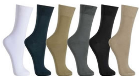
MEIA INAJA 240 SOCIAL VALOR R$ 3.20