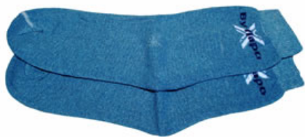
MEIA BY FIAPO JUVENIL BF 09 VALOR R$ 3.70