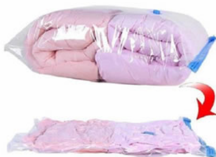
SACO VÁCUO 50X60 VALOR R$ 5.70