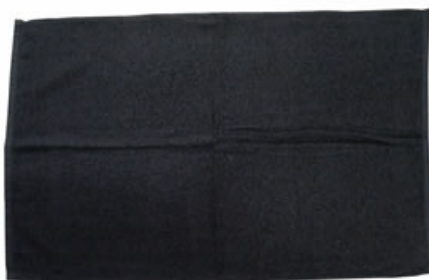
TOALHA SALAO MARCOTEX 44X70 VALOR R$ 5.20