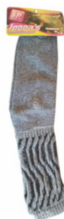
MEIA AEROBICA 141 LOPPAS VALOR R$ 2.70