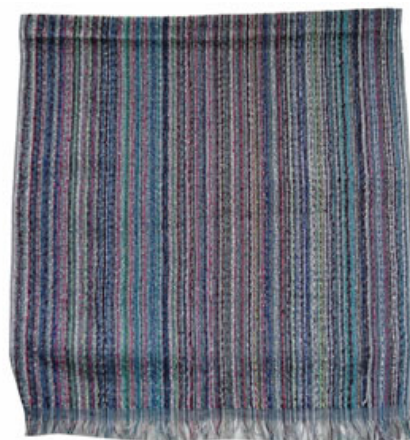
TOALHA BANHO LISTRADA FAAP VALOR R$ 4.90