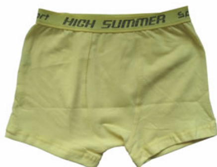
CUECA BOXER INF. 000HS VALOR R$ 5.15